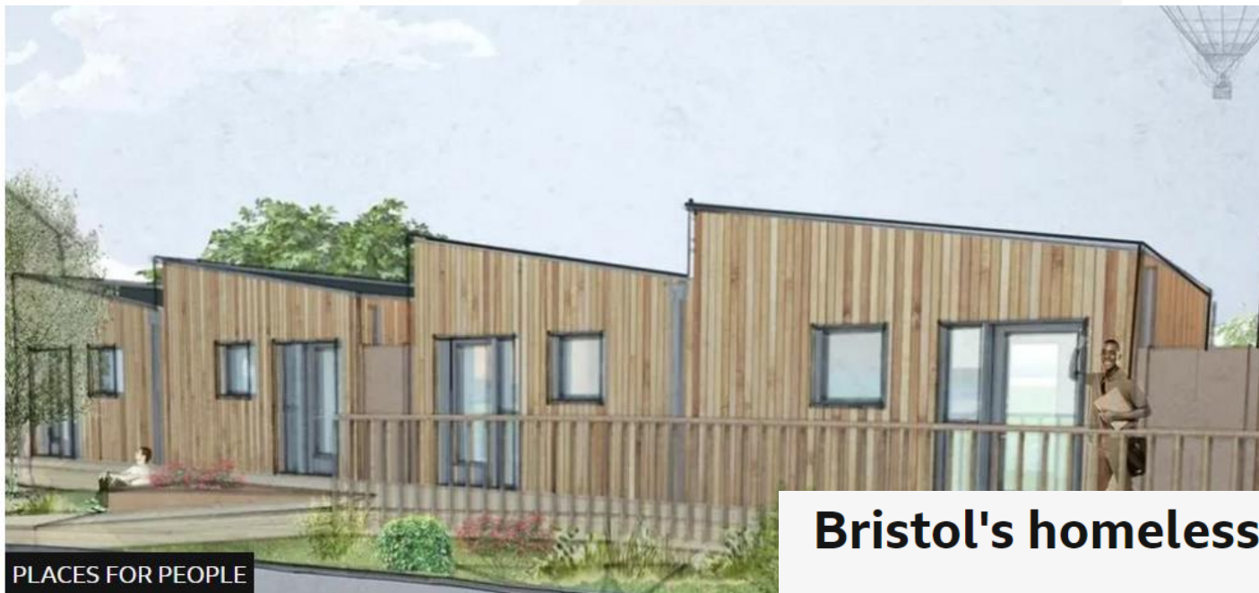
Bristol pod homes built to support homeless people - BBC News