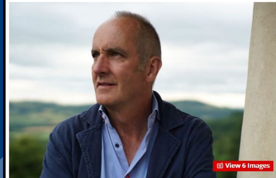
Kevin McCloud, presenter of Channel 4 programme 'Grand Designs'

The British designer has a few abodes across the UK, with his home in the Peak District costing a cool million.